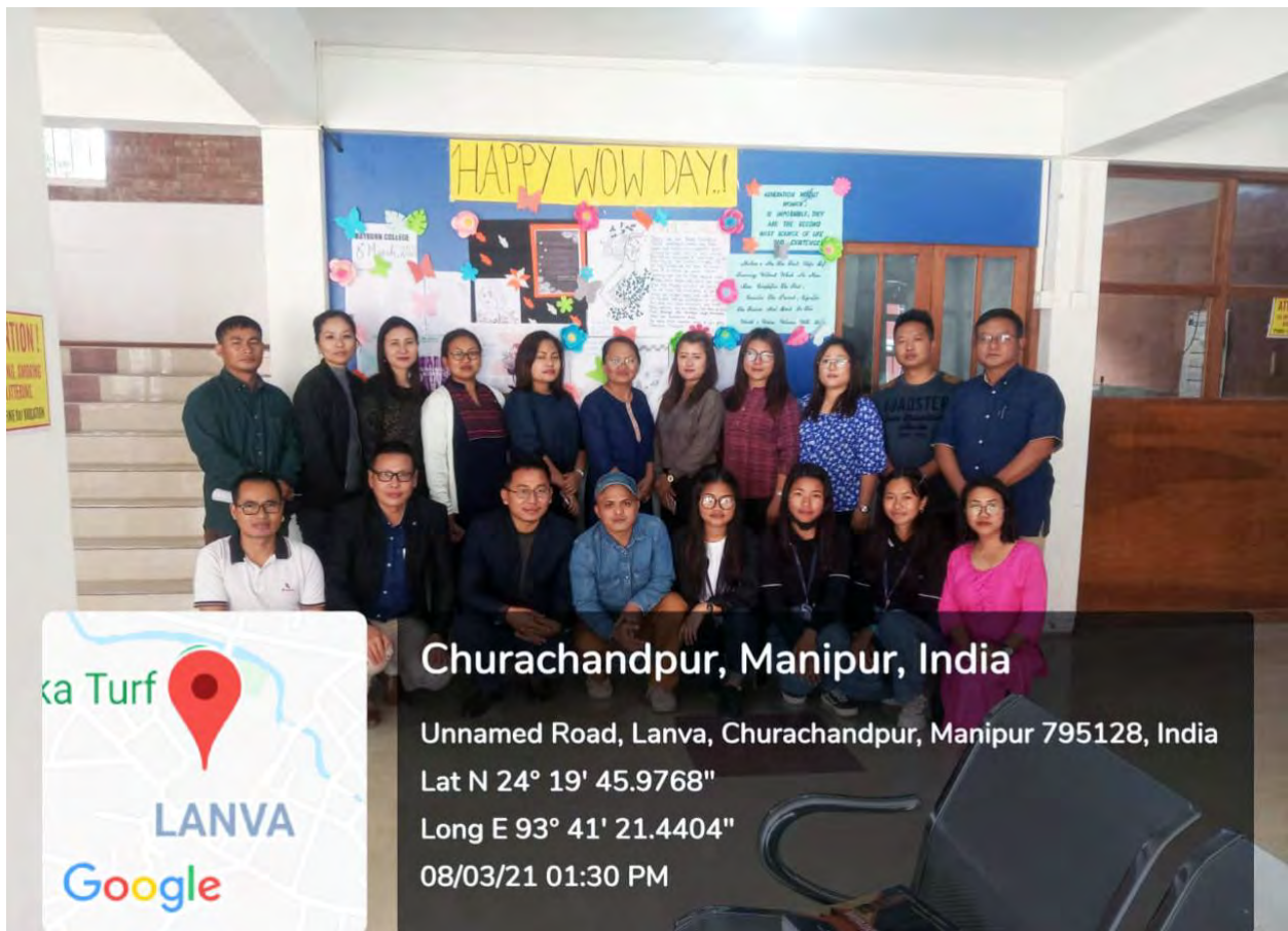
c. Observation of international women's day, 2021