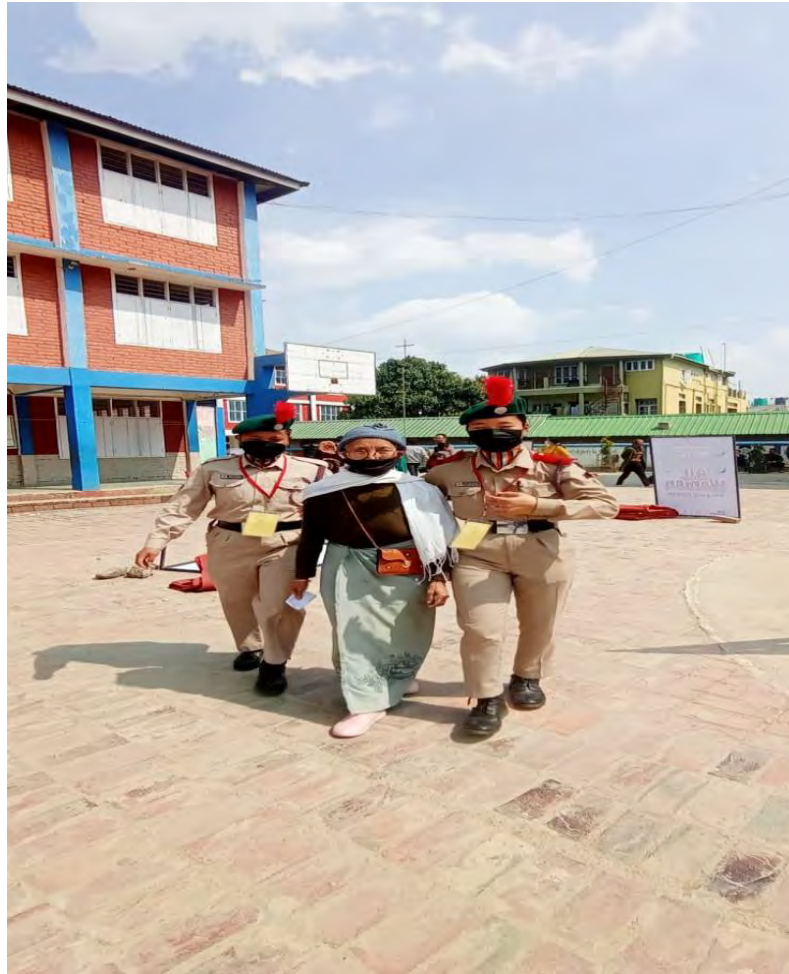
b. NCC assisting the elderlies during Manipur Genral election, 2022 at Hebron Veng, New Lamka polling station