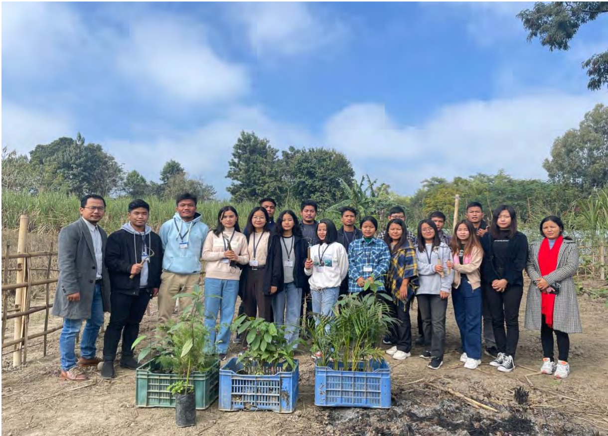
a. Department of Botany donating plant and flower sampling to NSS for plantation in the campus