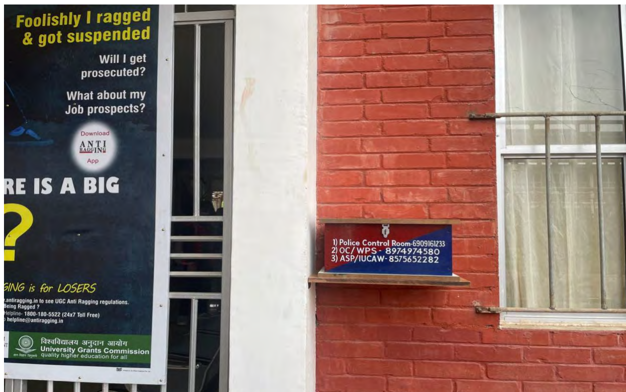
d. Grievance Box in the college for addressing any complaints regarding gender discrimination, sexual harassment, well-being & safety of female students/employees in particular within college premises.