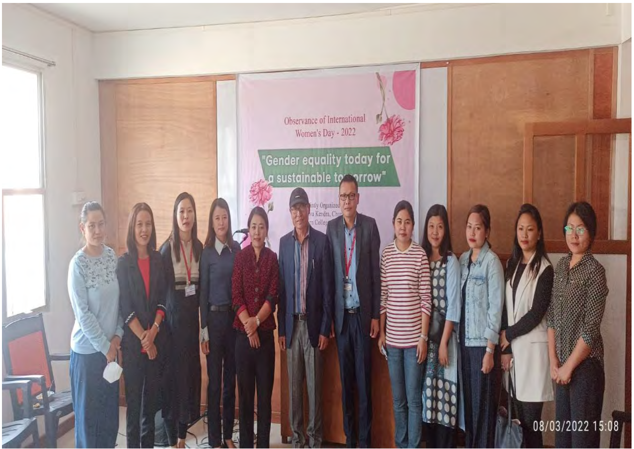
b. Observation of International women's Day, 2022