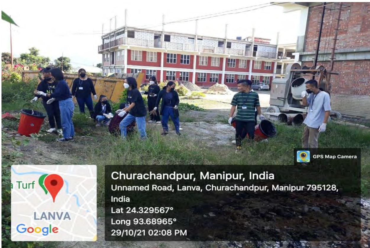
c. Cleanliness drive within the college campus and its premises under the initiative of NSS