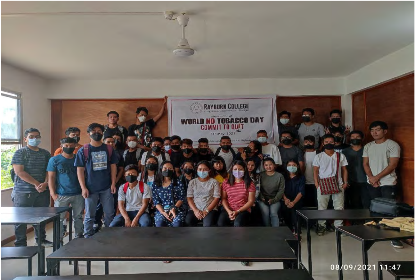
d. Observation of World No Tobacco Day