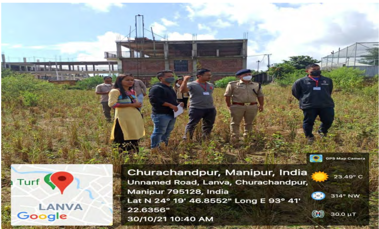
d. Visit from Forest Department, Churachandpur, Government of Manipur for “Clean Campus, Green Campus”