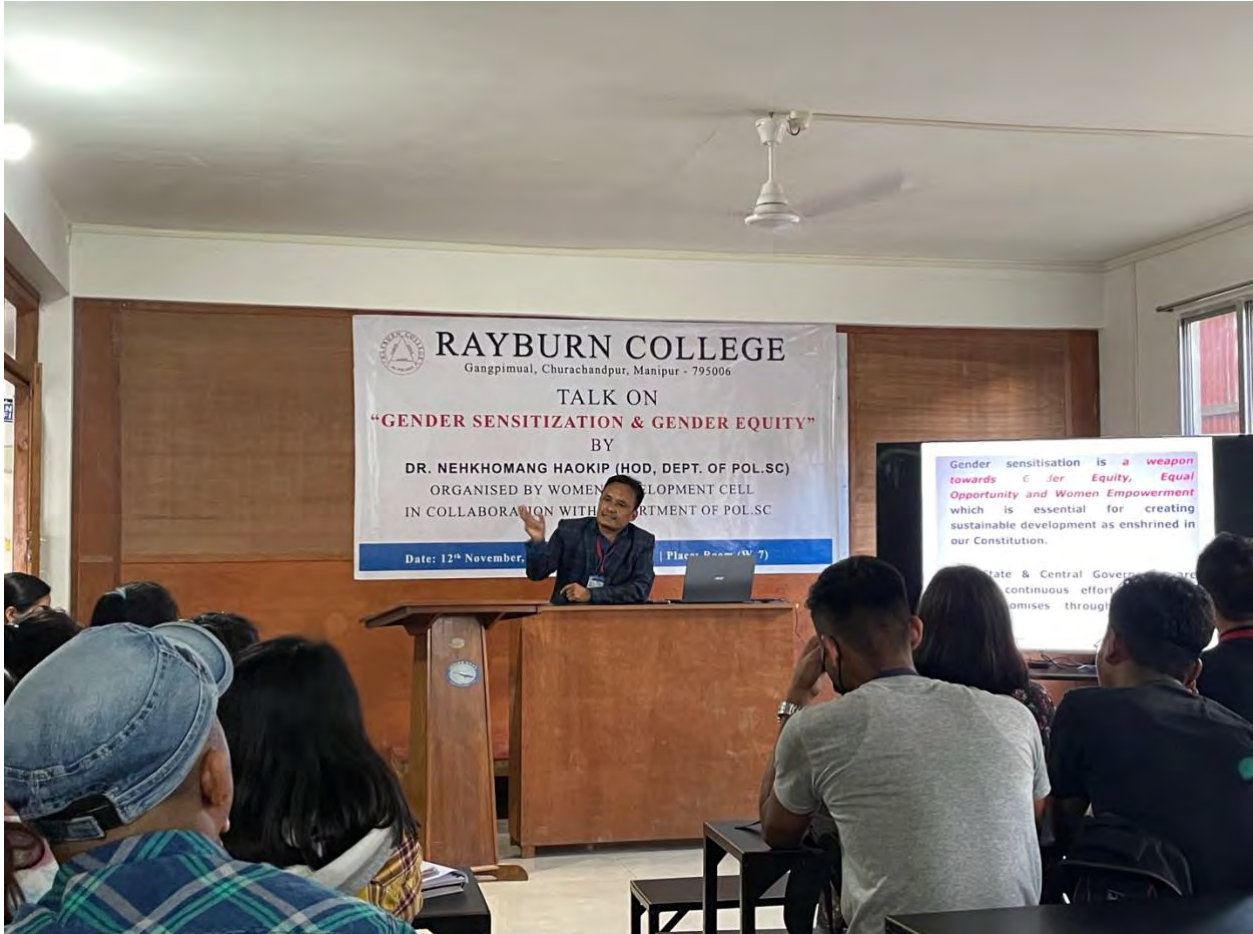
a. Talk on “Gender Sensitization & Gender Equity”

Women Development Cell (WDC) has been constituted in the year 2020 to address the issues of gender discrimination, sexual harassment, wellbeing & safety of female students and employees within the college premises. WDC has also been actively involved with the welfare of the female students and employees within Rayburn College community.