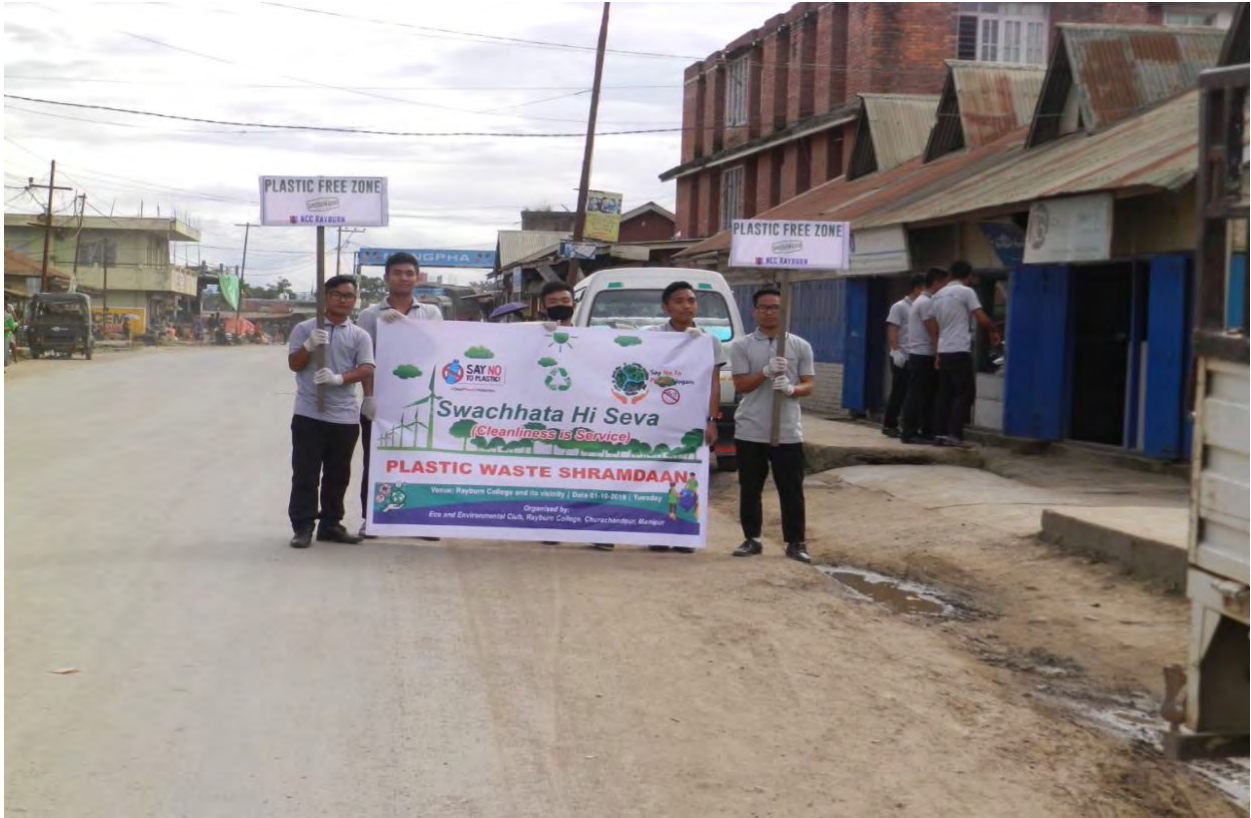
f. Cleanliness drive and rally during Swachhata Hi Seva Campaign