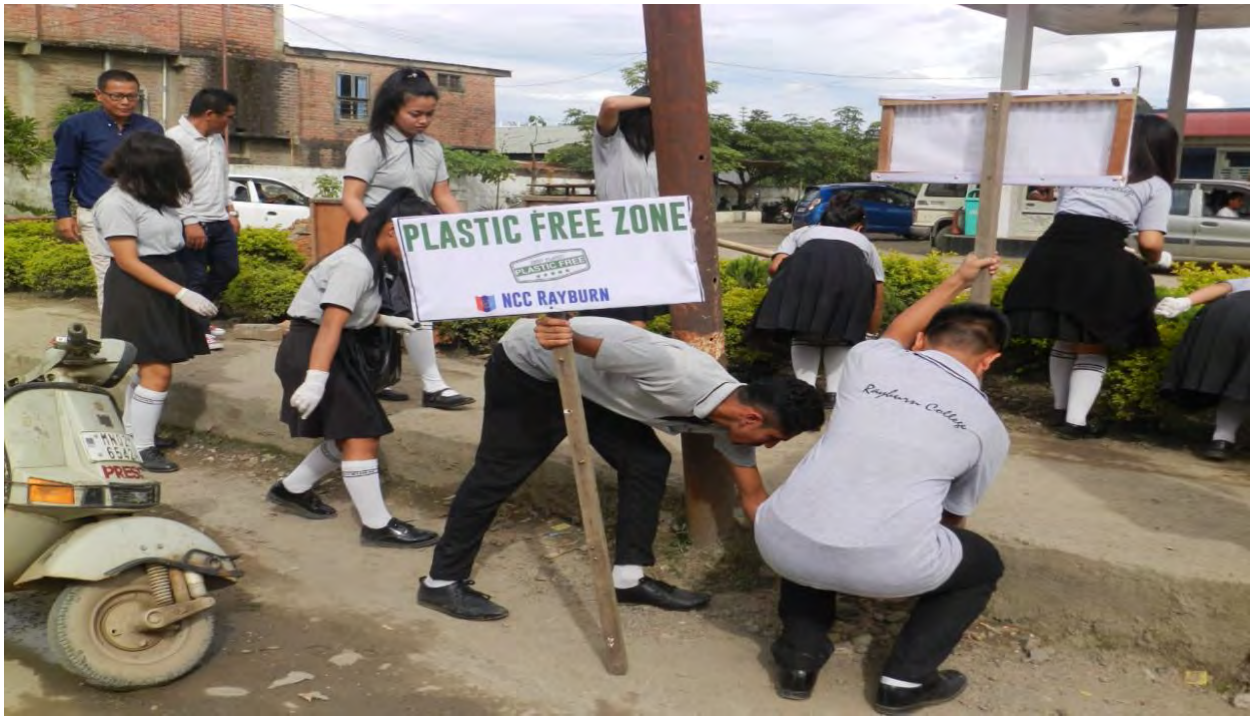
g. Cleanliness drive during observation of Swachhta Pakhwada