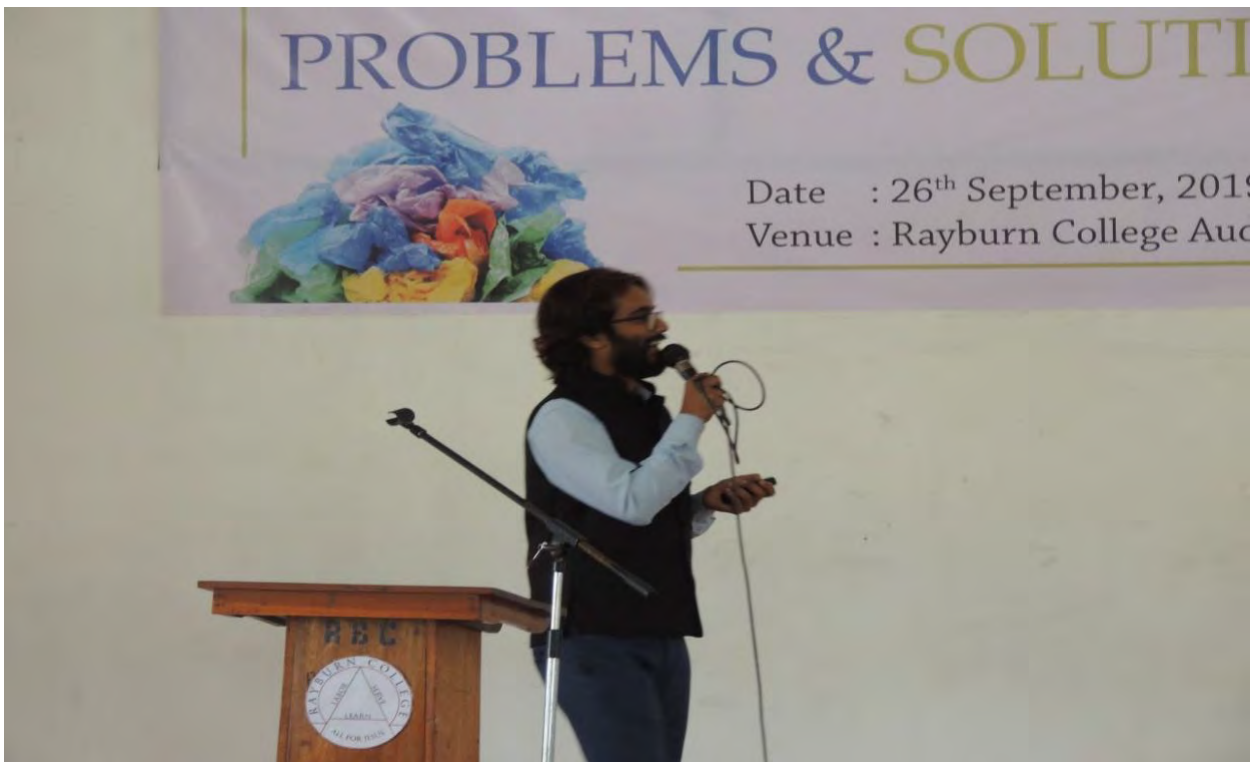
h. Workshop on "Plastic Pollution: Problem & Solution"