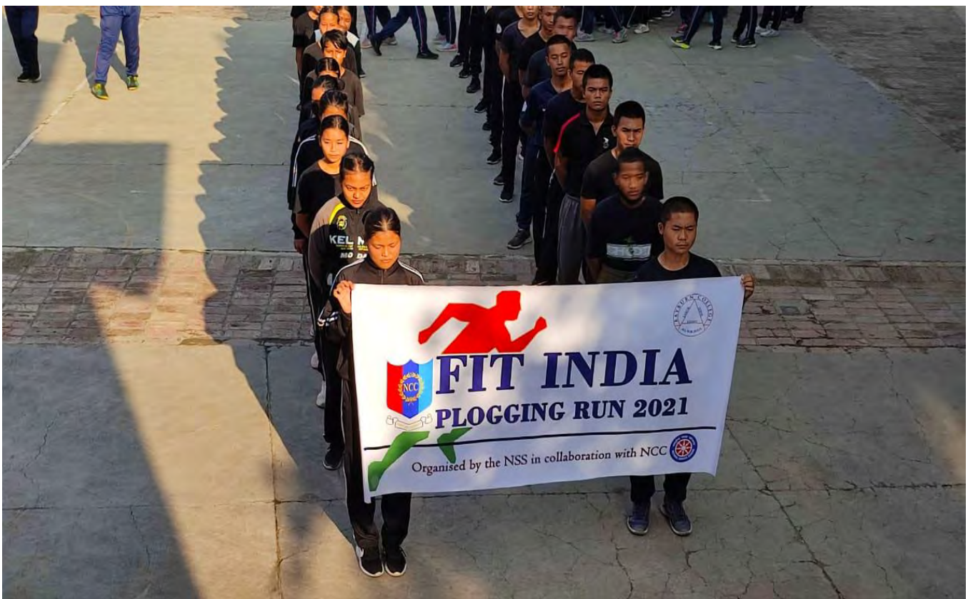
e. Plogging run organized during Fit India Movement