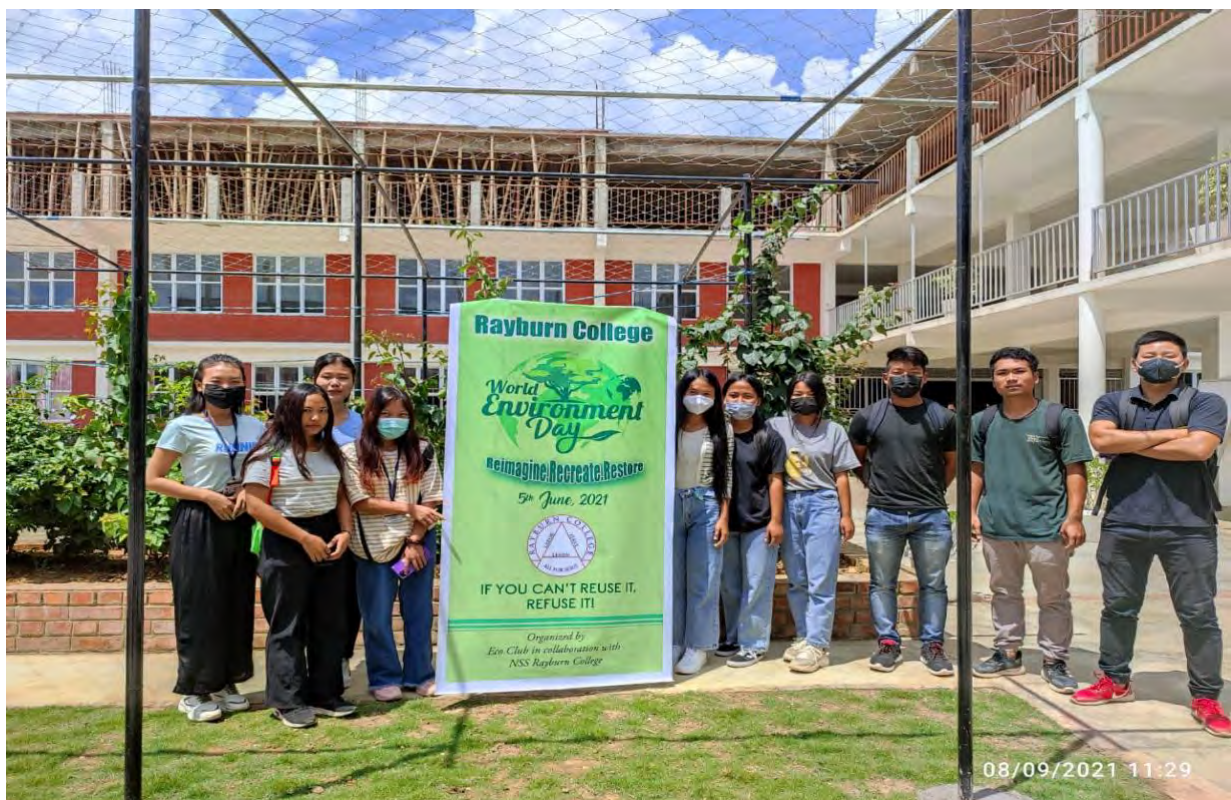
b. Observation of World Environment Day, 2021