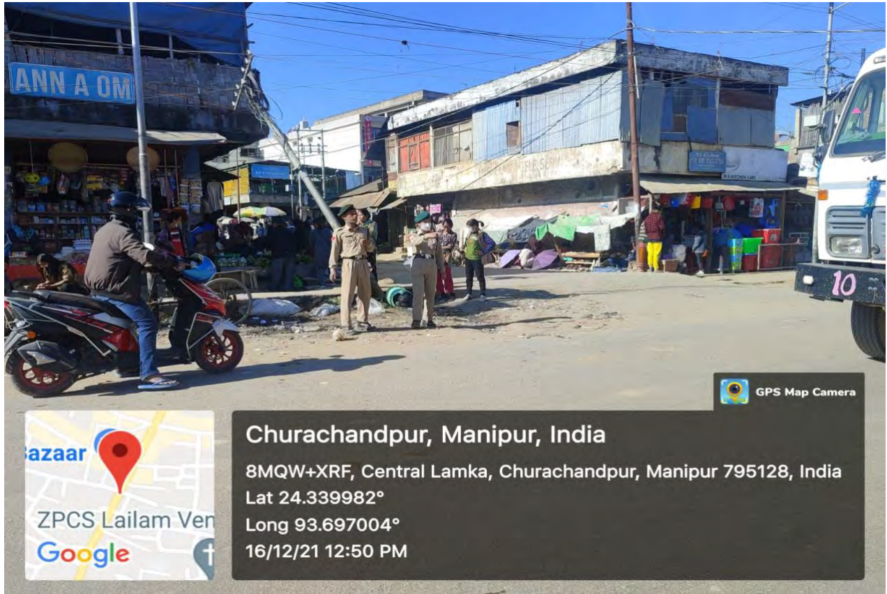
a. Rayburn NCC assisting Churachandpur Traffic Control Police